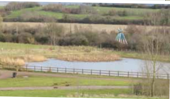
View across the pond towards the railway path

One of the largest earth sculptures in the world, extensive views from the top of the earth sculpture and Rodway Common, and a varied landscape make this an interesting walk. Mostly hard surfaces. There are steps up to the top of the earth sculpture, but these may be avoided (see below)