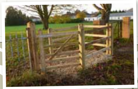
The kissing gate to Hill House Road open space

8 For the Longer route : Continue along the railway path, taking the left