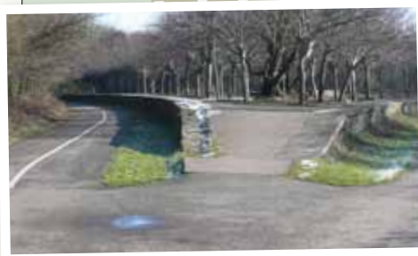
The path forks at the old Mangotsfield Railway Station